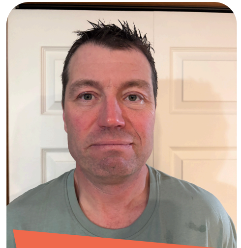
Afternoon Workshop - Speaker