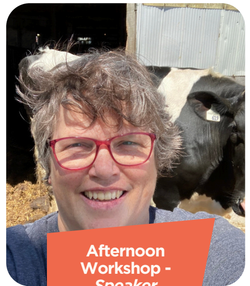
Afternoon Workshop - Speaker

She is also pursuing continuing education through college courses and leads excursions for her five grandchildren as part of the 'Adventure Team'